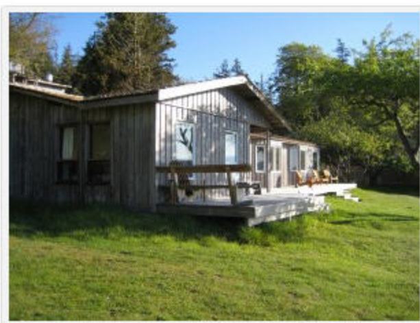
Beachfront cabins at Hollyhock