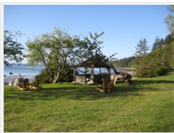
Relax on the shores of Hollyhock