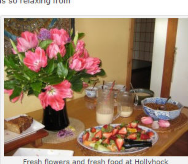
Fresh flowers and fresh food at Hollyhock