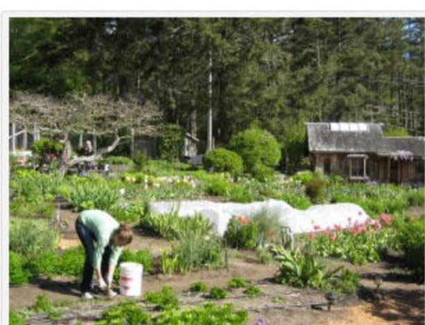
Spring gardens at Hollyhock